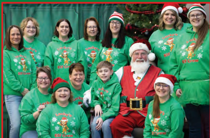
Lucky's Elf Crew

CCU's Lucky Lion invited members to join the fun and meet Santa on Saturday, December 13 at the CCU office on McIndoe Street. Kids had the opportunity for photos with Santa, and to enjoy crafts and snacks. It was a wonderful morning enjoyed by the kids, parents, and staff.