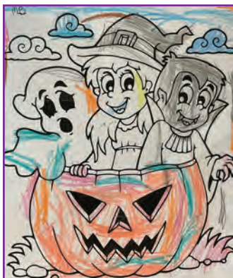
Maxwell B. – age 4 Wausau West Side Winner